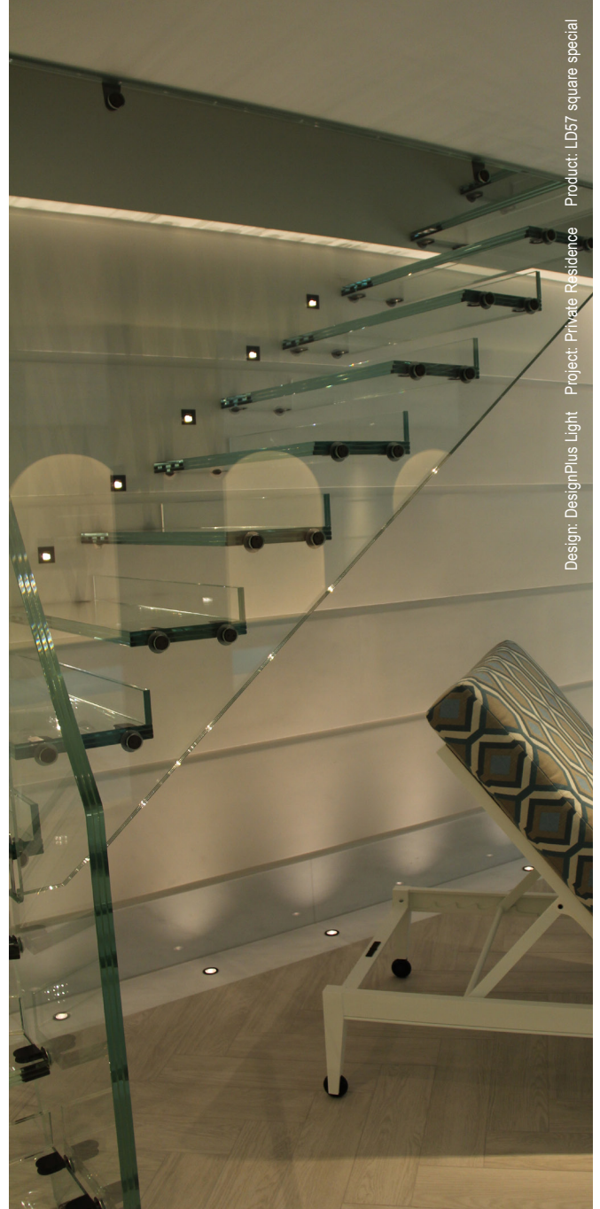
Design: DesignPlus Light Project: Private Residence Product: LD57 square special